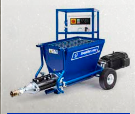
ROTOR STATOR PUMP

If you like the compact size of the P20 rotor stator pump, but are looking for more output, the ToughTek P30HT is the perfect fit for your business. Upgrade to this pump if you plan to use epoxy-based mortars (or other thick high-viscosity materials) or plan to spray taller buildings, such as sport stadiums, high-rises, apartment complexes, hospitals or parking garages to name a few.