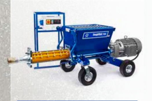
ROTOR STATOR PUMP

Known as the workhorse because of its 600 psi output pressure, the ToughTek P40 is built for high volume applications. The high flow rate and high pressure allows contractors to pump repair mortar up a tall building while keeping the pump on the ground, saving your operation time.